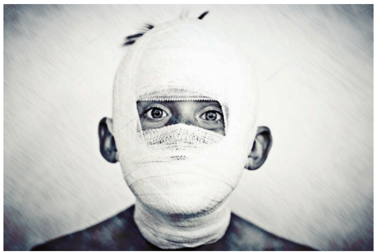
Let us be silent, that we may hear the whisper of God